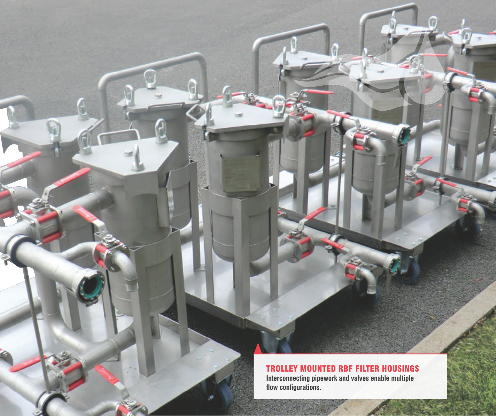
TROLLEY MOUNTED RBF FILTER HOUSINGS Interconnecting pipework and valves enable multiple flow configurations.